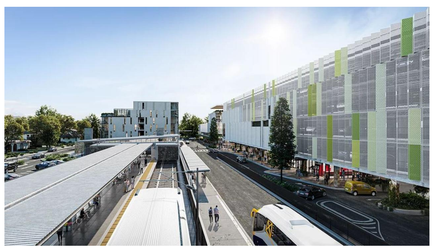
Artists impressions of the $140 million Ferny Grove Central project, construction is now underway.

"We see this as a very important urban renewal project for Ferny Grove and for Brisbane's northwest and we're passionate about projects that breathe new life into communities."